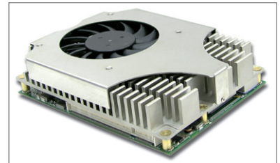
Active Heat Sink