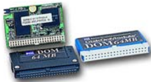
PEP-1040/50 /60/ 70