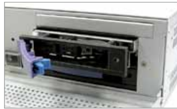
Two Swappable SATA HDD Drives Easy to access HDD drives