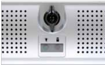
Thumb Lock Convenient to operate or protect the system