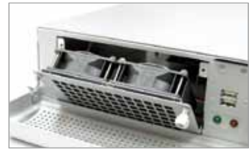
Front Replaceable Air Filters/Fans Convenient to change air filters or fans when needed