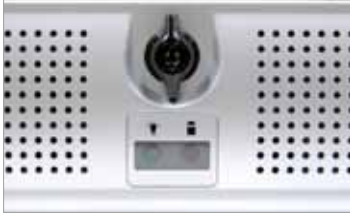
Thumb Lock Convenient to operate or protect the system