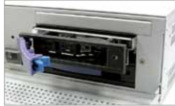
Two Swappable SATA HDD Drives Easy to access HDD drives