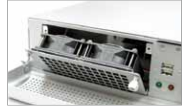
Front Replaceable Air Filters/Fans Convenient to change air filters or fans when needed