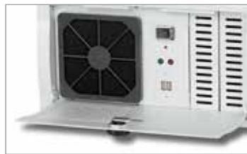
Plastic Fan Filter For easy cleaning and replacing