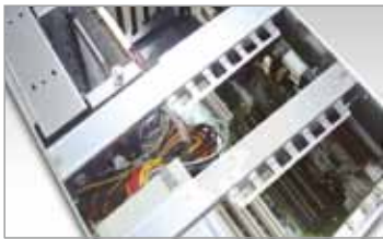
Two Adjustable Card Retainer Positions For fixing all the cards more flexibly and tightly