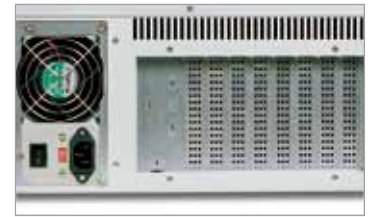
Excellent Cooling System New slot cover for better ventilation