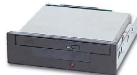
▲ EZDRV-200NCF (NB CD-ROM and drive bay for 3.5" HDD)