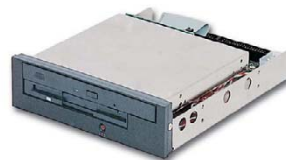
▲ EZDRV-300NCF (NB CD-ROM, NB FDD and drive bay for 2.5" HDD)