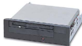
▲ EZDRV-200NF (NB FDD and drive bay for 3.5" HDD)