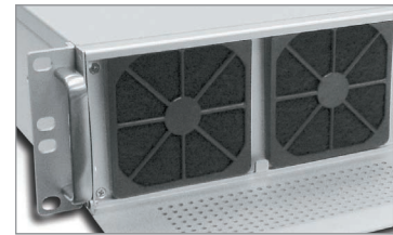
Front Replaceable Air Filters Convenient to change air filters when needed