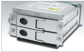
Hot-Swappable HDD Drives Easy to access HDD drives